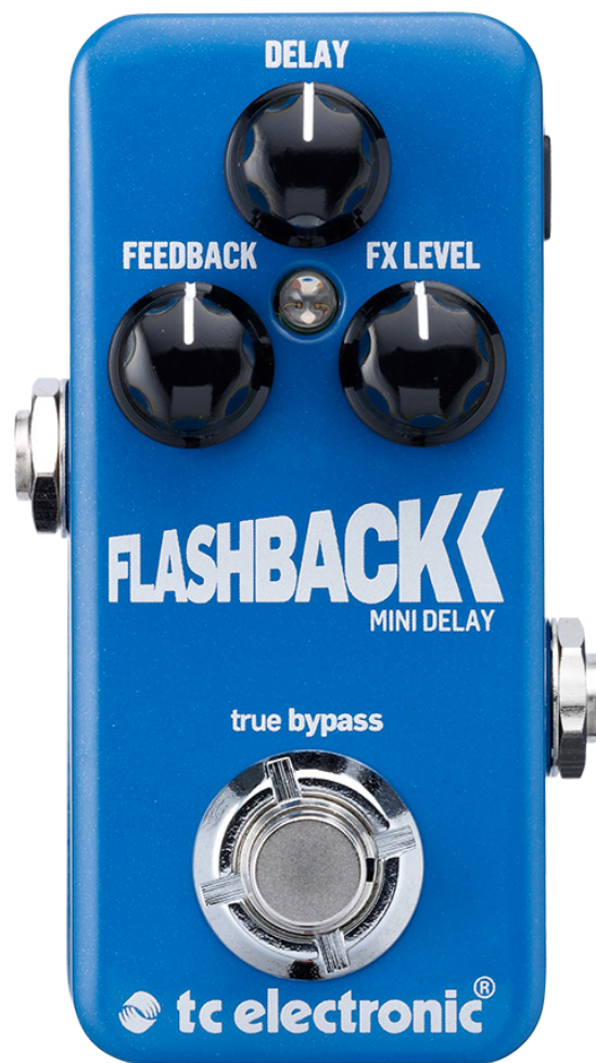
Flashback Mini Delay