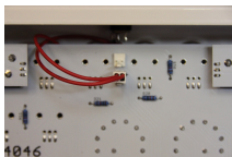
Standard boss style 9VDC Center negative

You can change power supply by changing the placement of internal connector under the bottom cover of the pedal.